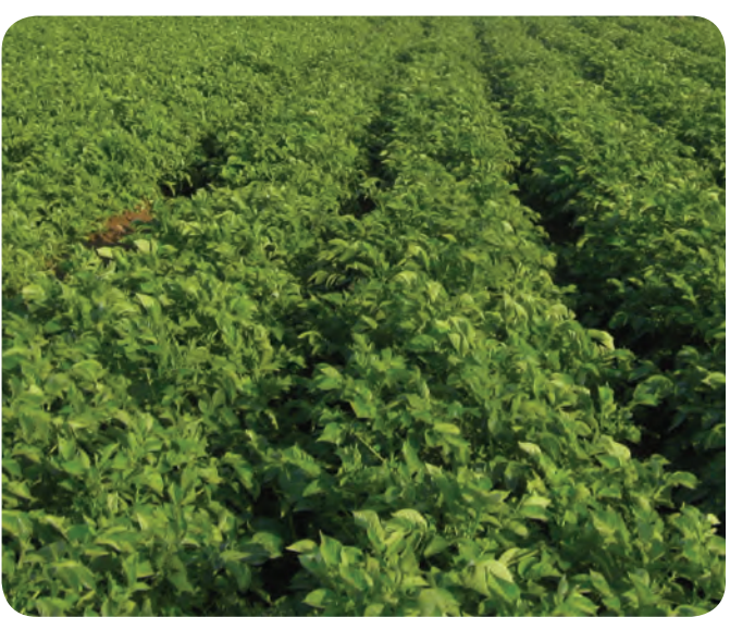
After Sub Surface Drainage